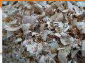
Use of Biomass to replace Fossil Fuel