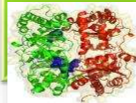
Use of various enzymes in desizing stage