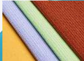
Cold Pad Batch (CPB)