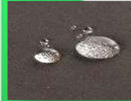
ZDHC (Zero Discharge of Hazardous Chemicals)